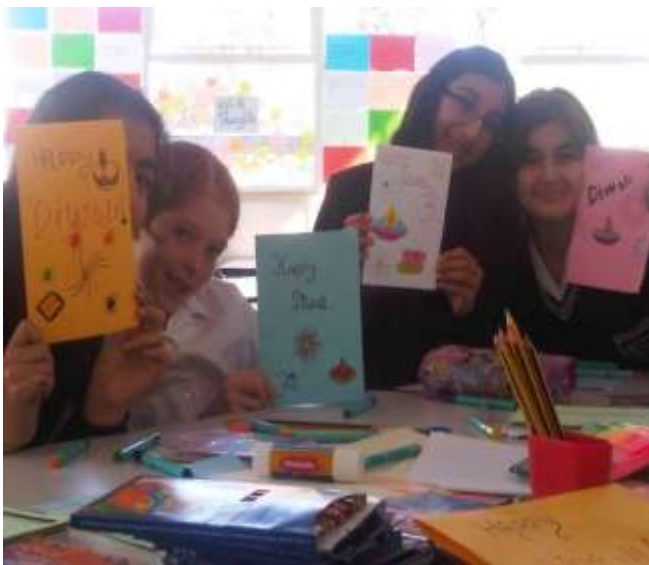
Diwali cards in Creative Craft Club

The Religious Education Department at Queensmead School have created a Diwali display with the help of some enthusiastic Year 7 students. We also held a Diwali card marking session in Creative Craft Club on Thursday 20 th October. In form time this week students have also learnt about the festival of Diwali and discussed what brings 'light' into our lives and our local community.