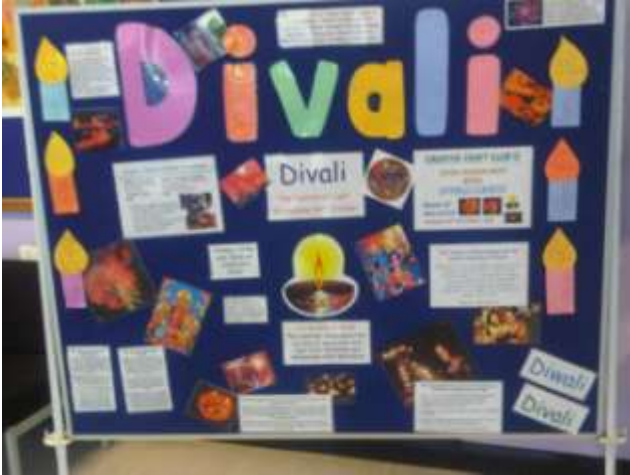
Display in the front foyer

This year Diwali, also known as Divali was celebrated on 26 th October. Diwali is known as the 'Festival of Lights' and it represents the victory of light over darkness and good over evil. It is celebrated by Hindus, Sikhs and Jains all across the globe.