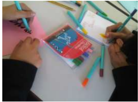
Diwali card design