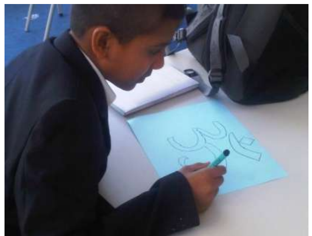
The Hindu Symbol Aum